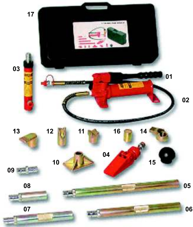
PA - 904A