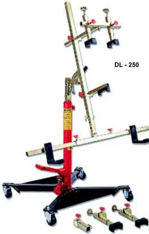
DL - 250