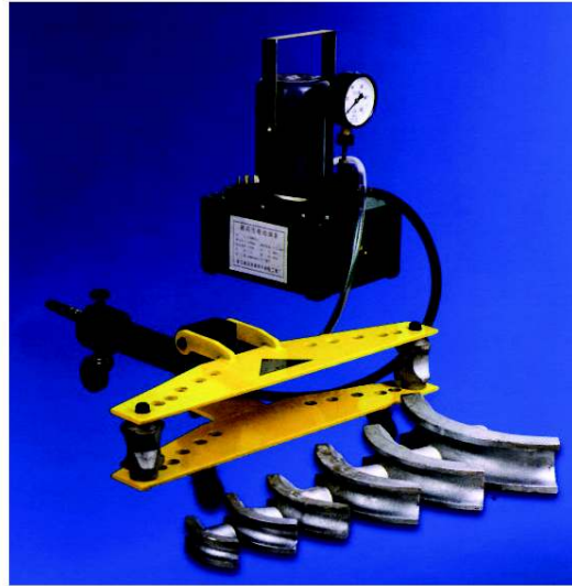
JMDWG - 2D / JMDWG - 3D / JMDWG - 4D