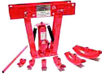
JM - 8012PB / JM - 8015PB