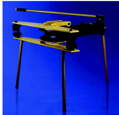
JMSWG - 4C