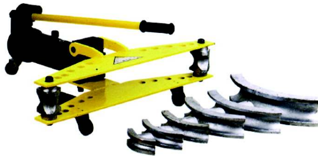
JMSWG - 2 / JMSWG - 3 / JMSWG - 4