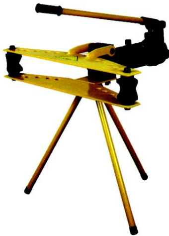
JMSWG - 2A / JMSWG - 3B